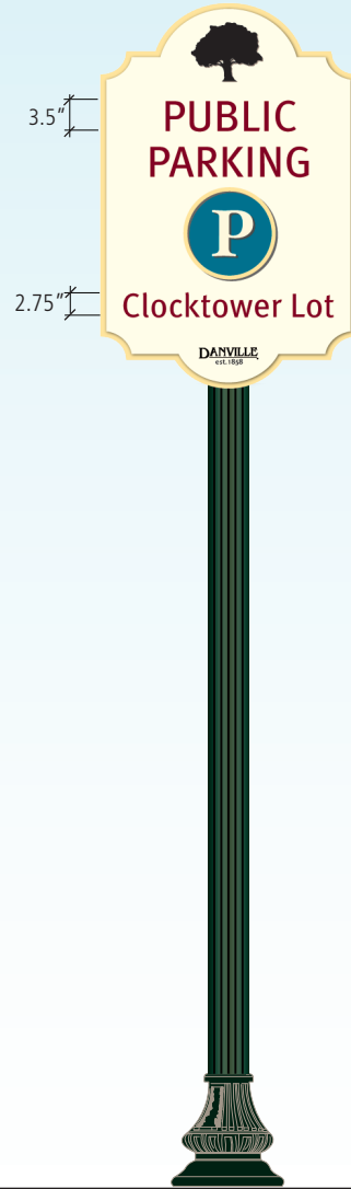
Parking Loto ID (PK) 60% of Original Proposed Size